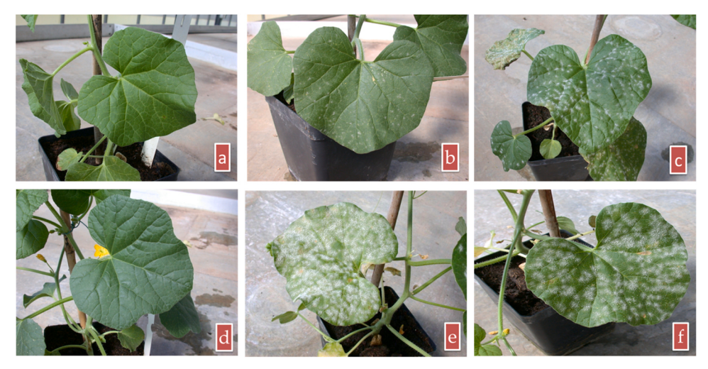
Fig. 4. Symptoms of powdery mildew disease on melon plants artificially inoculated with P. xanthii under different treatments. 100% CFS of B. subtilis ET-1 (a), 10% CFS (b), 1% CFS (c), chemical fungicide (d), control treated with water (e) and with sterile HMB medium (f).