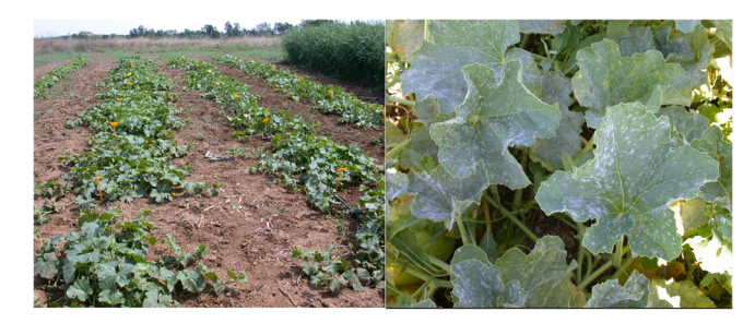
Fig. 2. Experimental field with Melon plants at the inoculation time of P. xanthii (left) and powdery mildew symptoms on control plants after 4 weeks from inoculation (right).

Open-field trials were carried out to evaluate the effect of the CFS and crude lipopeptide extract on control of powdery mildew disease (causal agent P. xanthii). The experiments were performed within ENEA Research Center (Rotondella, Italy) located in South-Eastern Italy (google maps coordinates: 40.16264964917399, 16.632217200299532) (Fig. 2). In specific, melon plants (C. melo L.) cv. Amarillo Oro, purchased from a local nursey, were transplanted in field at the end of May. One month after the transplantation, the artificial inoculation of P. xanthii was performed by nebulizing the conidia suspension (5 \times 10^5 conidia mL<sup>-1</sup>) uniformly on all plants. The treatments were carried out at 2 and 12 days from the inoculation by spraying uniformly on the foliage of melon plants. Based on the results observed in the greenhouse trials, the CFS and the crude lipopeptide extract suitably diluted to reach an Iturin A content of about 100 mg L<sup>-1</sup> (or 100 ppm) were used for the treatments. Water and Fenbuconazolo at the concentration used in greenhouse trials were used as negative and chemical control, respectively. For all treatments a range of 300-500 L ha<sup>-1</sup>, depending on the phenological phase of the plants, were