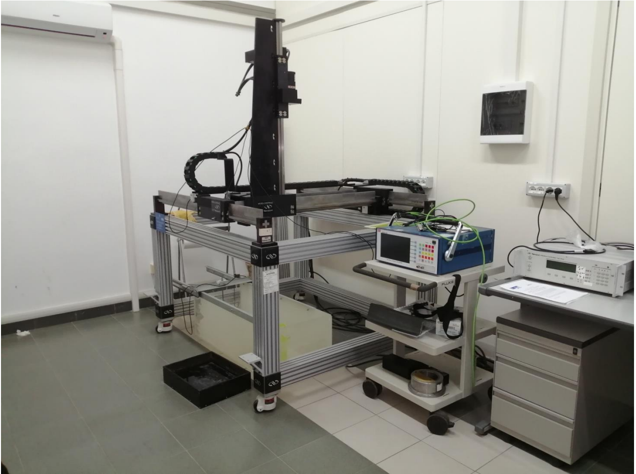
System Motion ENEA Brindisi

Omniscan Olympus MX2 phased array 64 element, Tofd ( Time OF Difrraction)