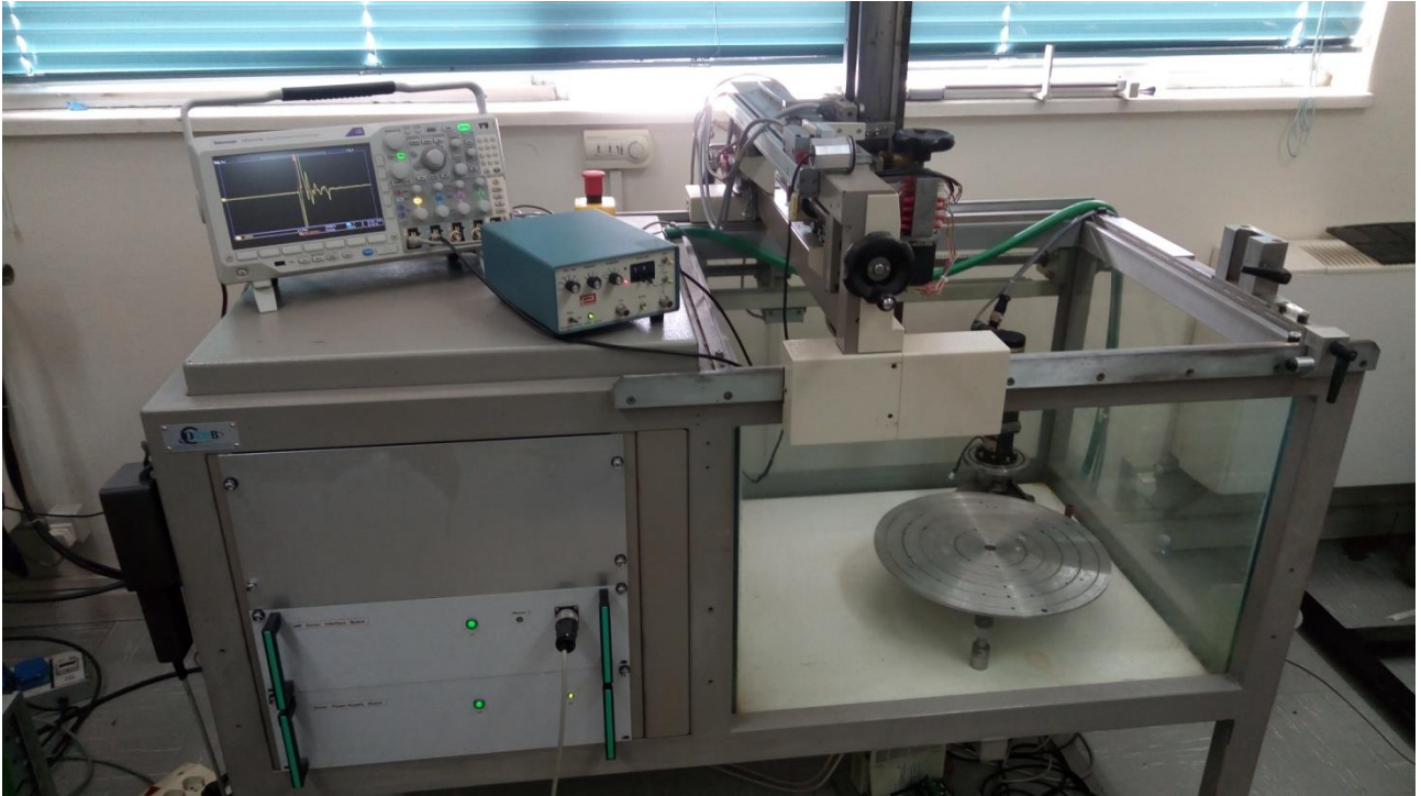
System Motion ENEA Casaccia

Panametrics 5073PR 75 MHz, Poves UT 1 MHz - 75 MHz