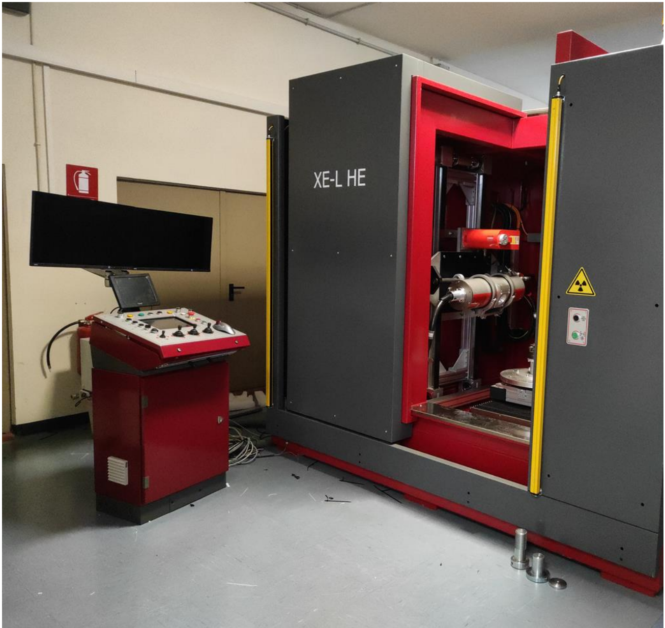
Gilardoni 450 kV industrial computed tomography system